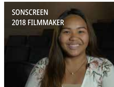
SONSCREEN 2018 FILMMAKER

More important, it was scripted storytelling. It was a drama. It wasn't a pastor in a studio giving a sermon or giving a talk, or a documentary. It was using storytelling,