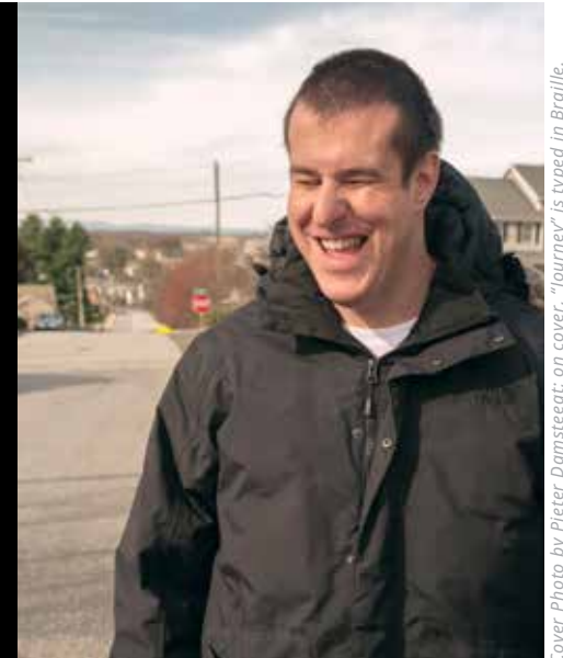
on cover, "Journey" is typed in Braille.

Dear Reader: The publication in your hands represents the collaborative efforts of the North American Division and Adventist World magazine, which follows Adventist Journey (after page 16). Please enjoy both magazines!