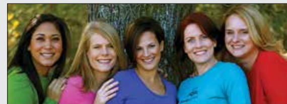
Message of Mercy