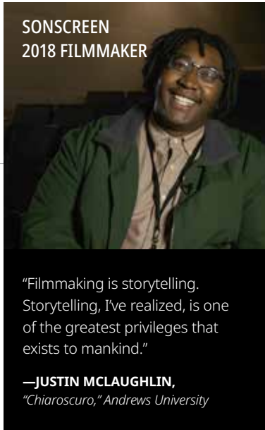
SONSCREEN 2018 FILMMAKER

"Filmmaking is storytelling. Storytelling, I've realized, is one of the greatest privileges that exists to mankind."