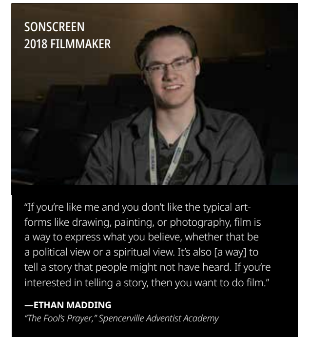
SONSCREEN 2018 FILMMAKER

The third part is to help create original content. Creating content, scripted drama, short films, feature films, TV shows, etc., takes money. We are blessed with support from the NAD, which helps us fund student attendance to the festival, and we were fortunate to receive a small grant in 2018 from the Versacare Foundation. Part of that grant helped us with the festival; we were also able to fund a