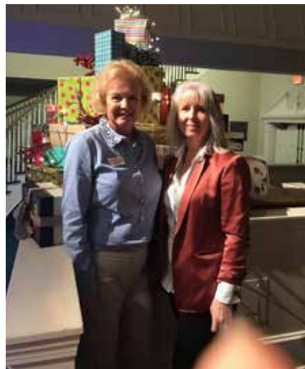
← More than 100 shoeboxes for those in need were packed by academy students and church plant members.

The shoeboxes also included notes of encouragement, and